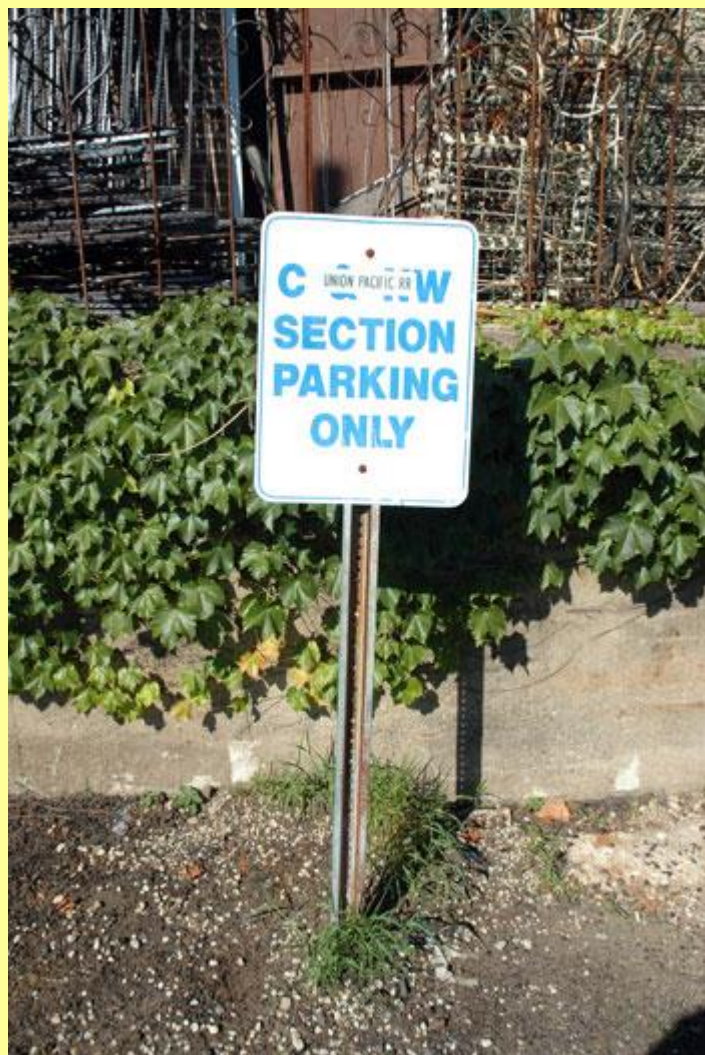
This C&NW parking sign at Harvard, IL was hastily changed to read UP but even this did not completely obliterate the C&NW !