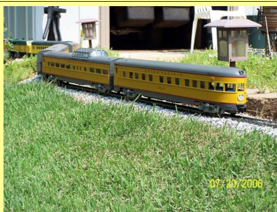
The 4103A on the head end of a streamliner complete with a dome coach and an observation car.