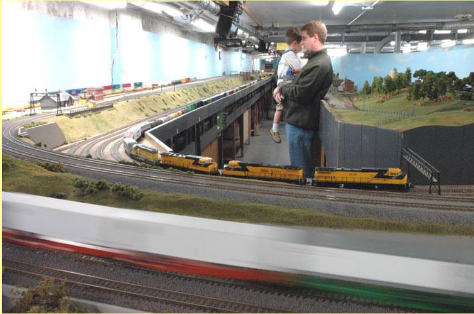
A trio of C&NW C44-9 units is running at the Elmhurst Model Railroad Club on 1/15/06.