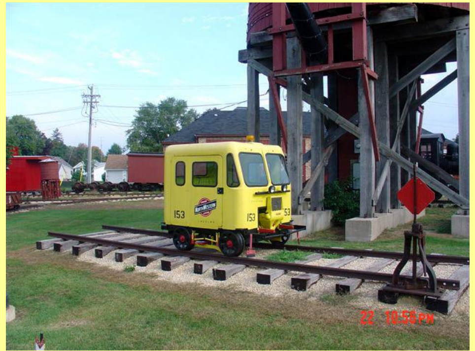
Ed Henry found this motor car at the Fennimore, Wisconsin railroad museum on September 22, 2005. If you look close between the water tank supports you will see the narrow gauge steam engine on display. Fennimore was the eastern end of the C&NW narrow gauge line running between that point and Woodman, Wisconsin. This line was abandoned in early 1926 following the last run on January 30, 1926.