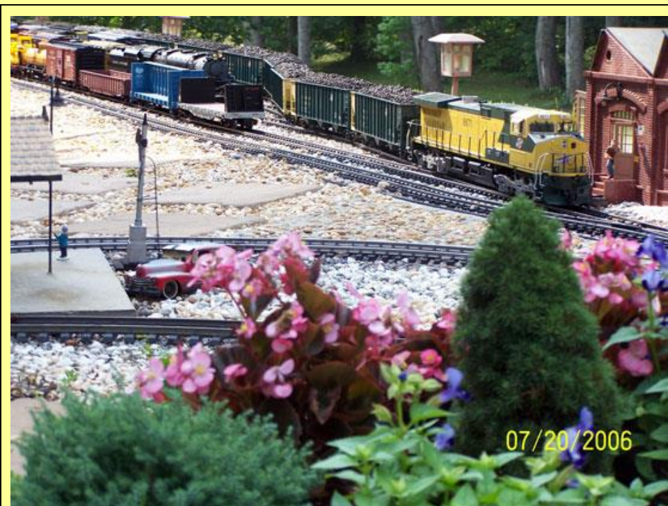
The 8671 on the head end of a coal train.